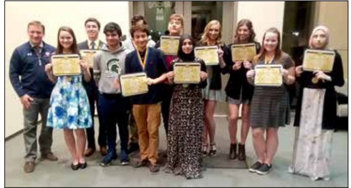
Students stop for a picture after receiving their award on December 7, 2018 at Moraine Valley.