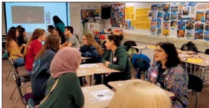
Stagg and Sandburg French students participate in a meet-and-greet activity at the D230 French Immersion Night.

learn to think on their feet, communicate clearly, show politeness and respect, and show curiosity about others by asking questions and responding to others."